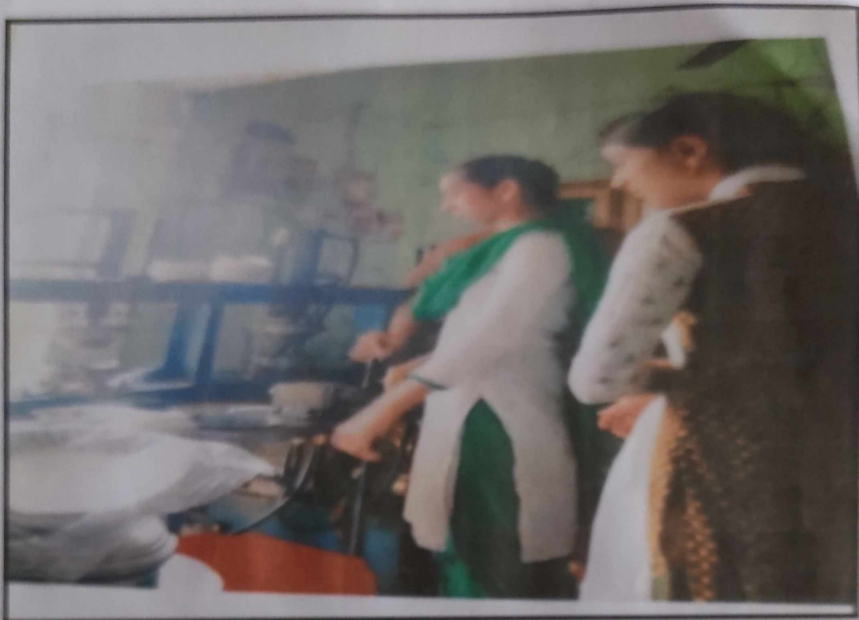
Observing the procedure