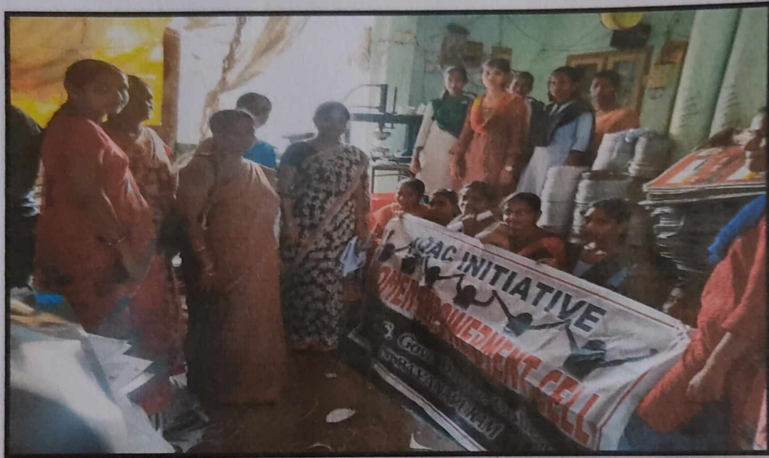
Women empowerment cell in the industry

In conclusion, the field visit organized by the Women Empowerment Cell was a resounding success, offering a valuable learning experience for all participants. It reinforced the college's commitment to providing holistic education and empowering women to explore diverse career paths and opportunities. The Women Empowerment Cell looks forward to organizing more such enriching experiences in the future to nurture and support the aspirations of its members.