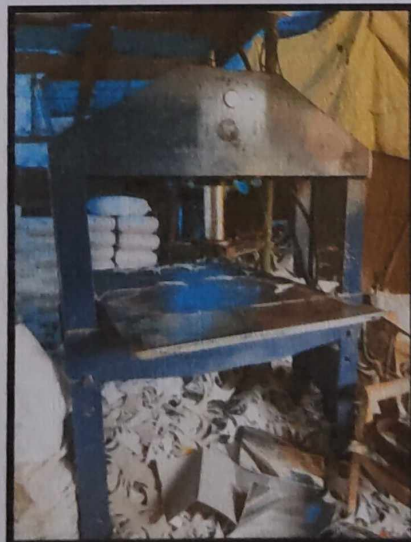
Machinery in the industry