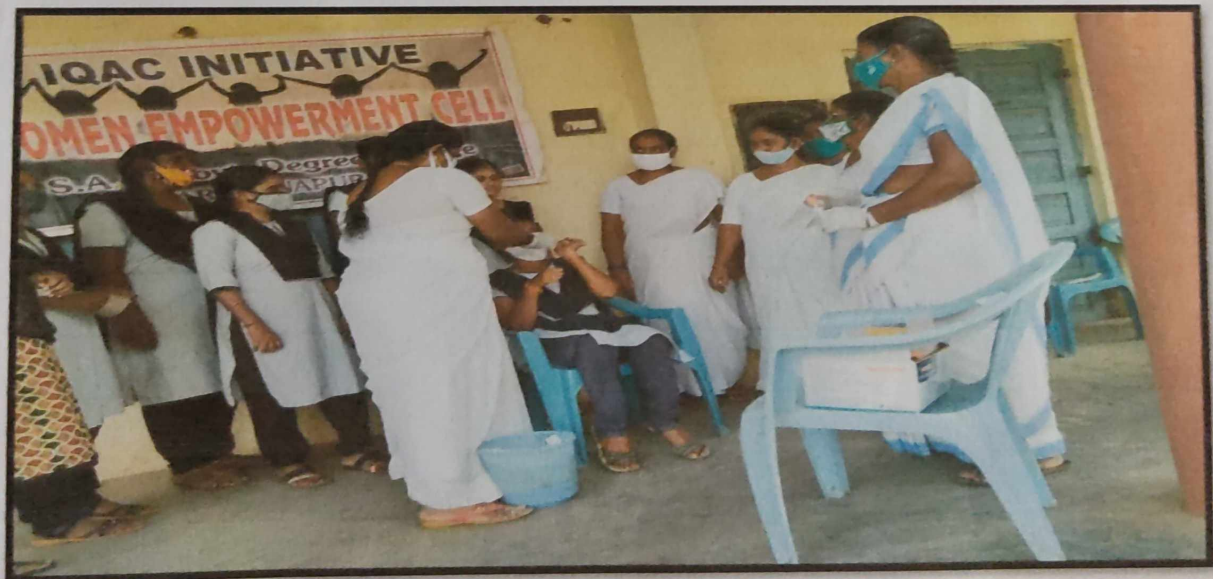
PHC staff taking sample