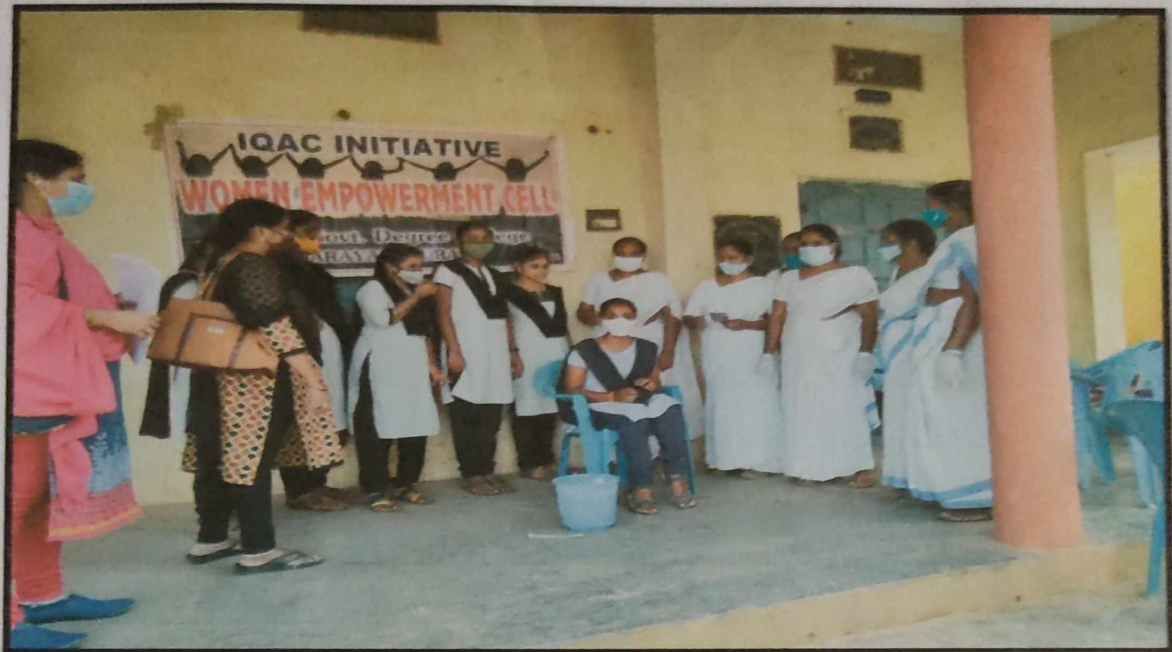
All set for test

The Women Empowerment Cell expresses gratitude to the PHC Staff of Narayanapura Village for their invaluable assistance and support in organizing the Health and Hygiene Awareness Program.